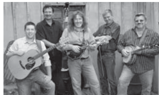
NOTHIN' FANCY (Thursday, 4th)