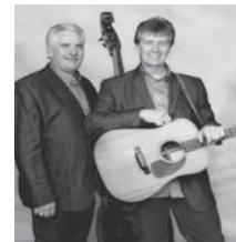
THE CROWE BROTHERS (Thursday, 4th)