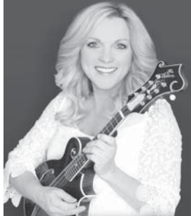
RHONDA VINCENT & THE RAGE "8-Time- IBMA Female Vocalist of the Year" (Saturday, 6th)