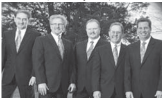
THE PRIMITIVE QUARTET (Friday, 5th)