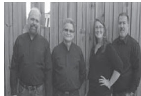
TENNESSEE GENTLEMEN LEGACY (Friday, 5th)