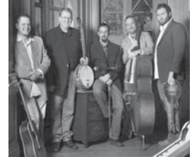
BALSAM RANGE "IBMA Entertainer of the Year 2014" (Saturday, 6th)