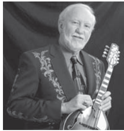
DOYLE LAWSON & QUICKSILVER "7 Time IBMA Vocal Group & Gospel Recorded Performance of the Year" (Friday, 5th)