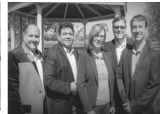
PENNY CREEK BAND (Friday, 5th)