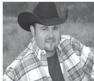
DARYLE SINGLETARY (Saturday, 18th)