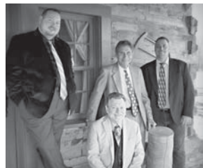
DRY BRANCH FIRE SQUAD (Friday & Saturday, 17th & 18th)