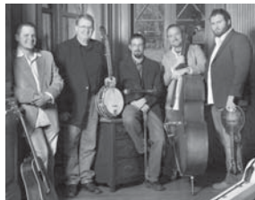
BALSAM RANGE "IBMA Entertainer of the Year 2014" (Saturday, 18th)