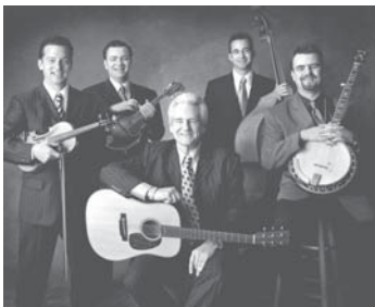
THE DEL MCCOURY BAND "Grand Ole Opry" (Thursday, 16th)

RODEHEAVER BOYS' RANCH 380 BOYS' RANCH ROAD PALATKA, FLORIDA 32177 (10 MILES S. FROM PALATKA ON STATE ROUTE 19)