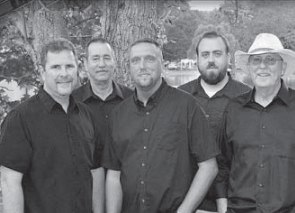
DEEPER SHADE OF BLUE (Friday, 17th)