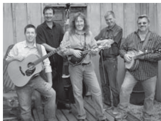
NOTHIN' FANCY (Friday, 17th)