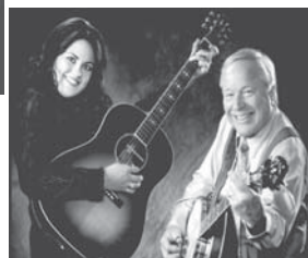
THE LITTLE ROY & LIZZY SHOW (Thursday, 16th)