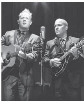
DAILEY & VINCENT "IBMA Entertainer of the Year" 2008, 2009 & 2010 (Friday, 17th)