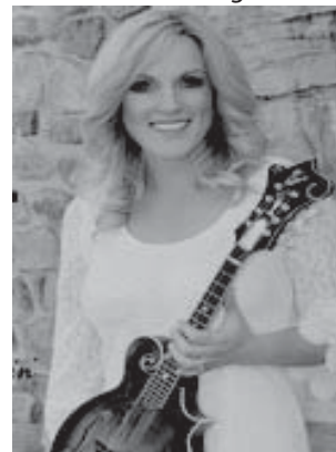
RHONDA VINCENT & THE RAGE (Saturday, 18th)