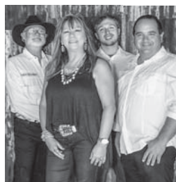
PENNY CREEK BAND (Thursday, 16th)