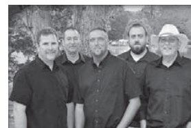
DEEPER SHADE OF BLUE (Thursday, 26th)

Security Guards On Duty NO Alcoholic Beverages, Smoking or Pets Allowed in Concert Area - Strictly Enforced - WE RESERVE THE RIGHT TO REFUSE ADMISSION TO ANYONE