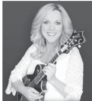
RHONDA VINCENT & THE RAGE "8 - Time IBMA Female Vocalist of the Year" (Friday, 27th)