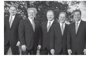
THE PRIMITIVE QUARTET (Thursday, 26th)