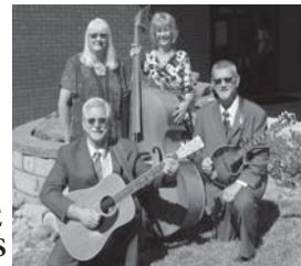
HEAVEN'S ECHOES (Saturday, 28th)