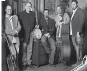
BALSAM RANGE "IBMA Entertainer of the Year 2014" (Saturday, 28th)