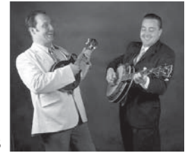
FELLER & HILL AND THE BLUEGRASS BUCKAROOS (Friday, 27th)